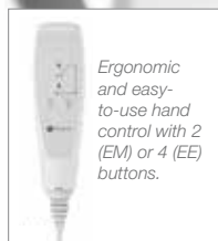
Ergonomic and easy-to-use hand control with 2 (EM) or 4 (EE) buttons.